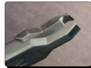
De-bonding tool to be used

Bonds & De-Bonds Just Like A Metal Bracket