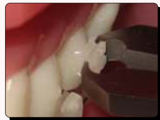
Grasp the brackets on the mesio-distal side close to the tooth