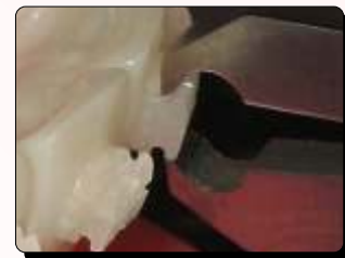
Wrong method of De-bonding