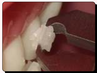
Twist the bracket 90° clockwise to safely remove the bracket